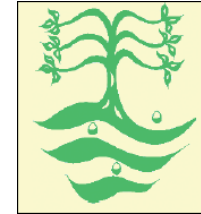
Association for Clinical Biochemists in Ireland